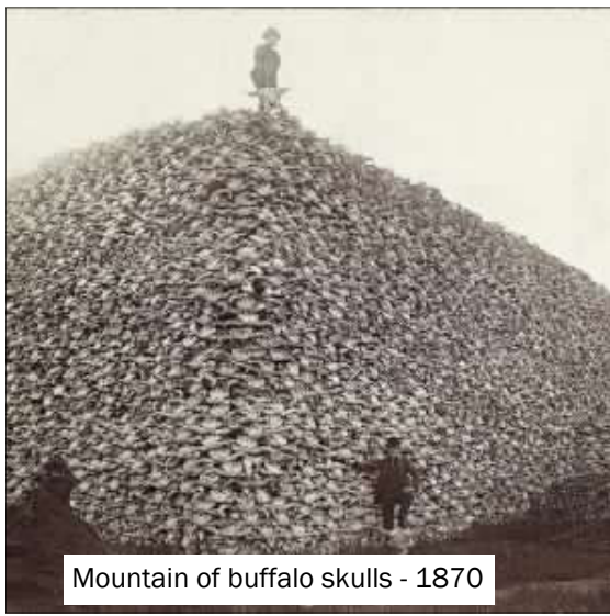
Mountain of buffalo skulls - 1870

Native people relied completely on the buffalo and faced starvation as the population declined. Who would have dreamed that could happen when as late as 1865 traders and trappers recorded seeing huge herds that stretched from horizon to horizon. By 1878 remnants of the once great herds were congregated around Fort Walsh and vicinity in the Cypress Hills, in the Milk River and farther south. By 1879 even those in the Cypress Hills were gone; the last one was reportedly shot in 1880 in the vicinity of Fort Walsh.