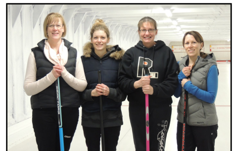
2016 Consul Ladies Bonspiel First Event Winners