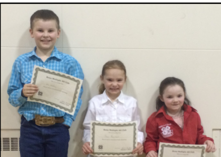
From top to bottom— Top 3 Speech Presenters in Intermediate, Junior, and Cloverbud Age Categories. Congrats to all participants!