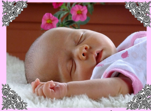
our precious baby girl