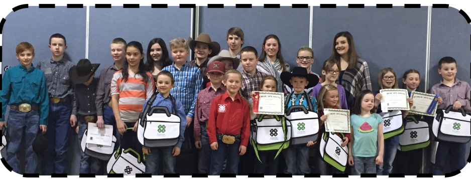
Reno 4-H Club - Speech Day 2017 - Job well done, everyone!