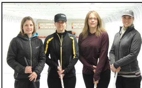
1st Event Winners