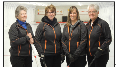
2nd Event Winners