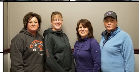
3 rd event Winners