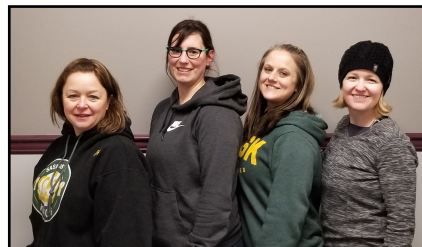
1 st event Winners