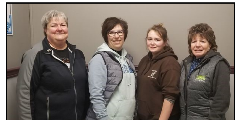
2 nd event Winners