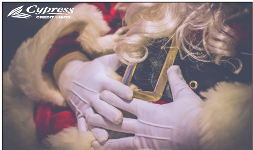
HO-HO-HO! All the way from the North Pole, Santa Claus is coming to our Consul branch December 11th from 2-3:30pm. Bring your camera to capture the moment & your Christmas wishes for the jolly big guy in the red suit!

Reno Rodeo would like to invite you to our 2020 New Year's Eve Bash at the Consul Community Hall. Come out for a steak supper, Silent/Live Auction and Live Band featuring ElektriK Mayhem. $40.00 Supper ticket, includes dance (105 supper tickets available). $15.00 dance tickets. Minors allowed with guardian supervision, 12 & under free admission to dance. Doors open at 5:00, supper at 6:00, and dance at 9:00 p.m. For tickets contact Denise 306-330-9022 or Quinn 306-299-7681.