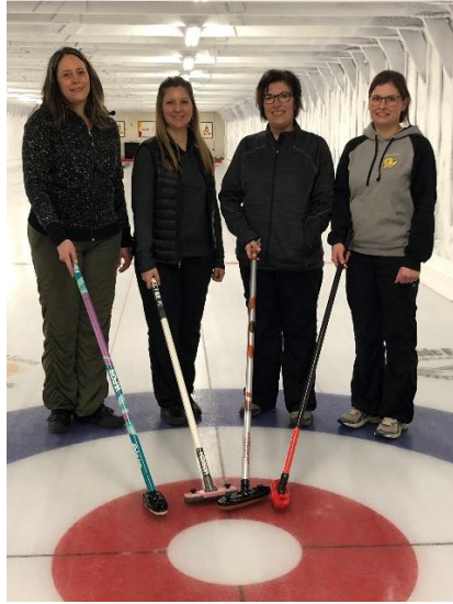
First Event Winners