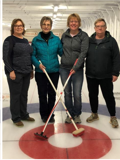
Second Event Winners