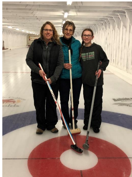
Three Generations of Curlers!