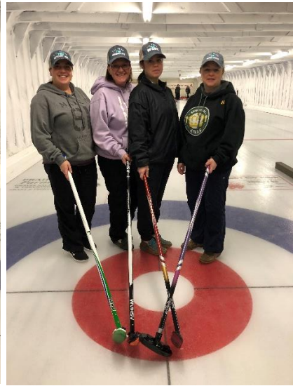
Third Event Winners