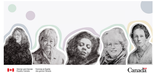
Women and Gender Equality Canada | Femmes et Égalité des genres Canada | Canada

October is Women's History Month in Canada, a time to celebrate the women and girls from our past, and our present, who are contributing to a better, more inclusive Canada.