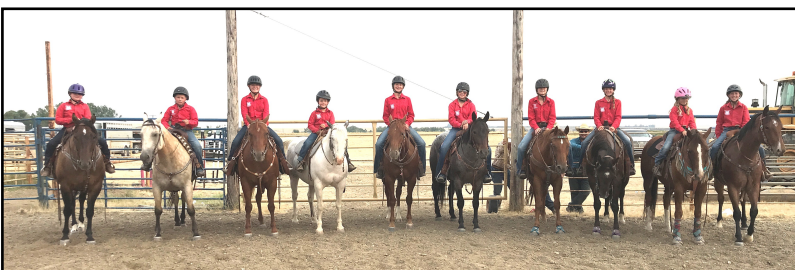
Ranch Horse Project Members - mounted & ready to ride

LOCALLY INVESTED COMMUNITY-MINDED LIFETIME MEMBERSHIP BENEFITS