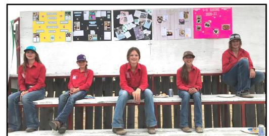
Baking Project Members with their display posters